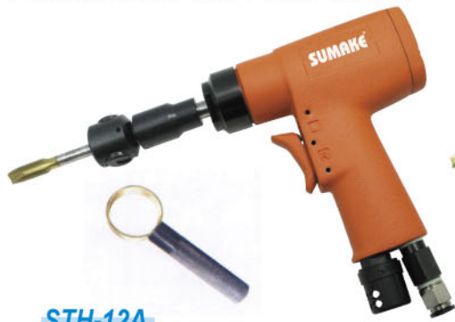
STH-12A Pneumatic Various degree Tapping Hand Tool