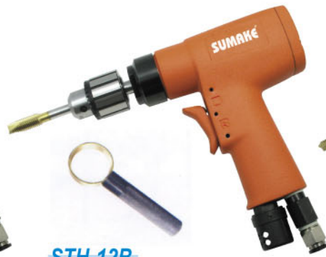
STH-12B Pneumatic Chuck Tapping Hand Tool