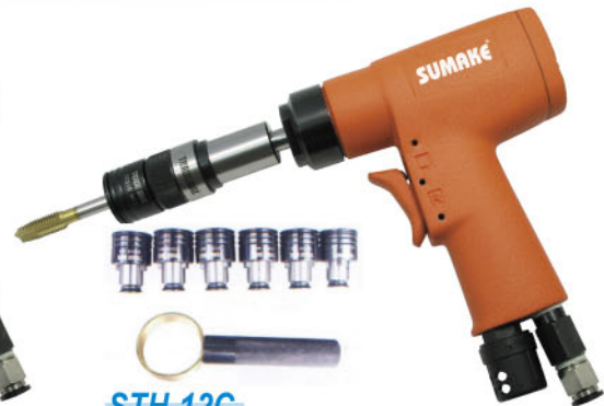
STH-12C Pneumatic Torsional Tapping Hand Tool